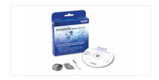
Bobbin Work (sewing machines) With the bobbin work kit, you can create a 3D-optic through the use of heavy threads on the bobbin case.